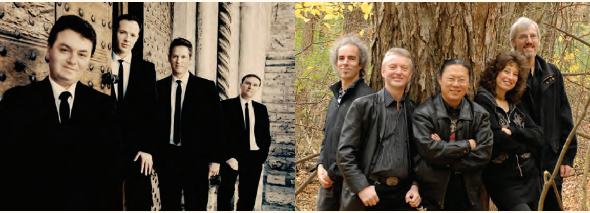
Jerusalem Quartet

Dvořák —String Quartet in G Major, Op. 106