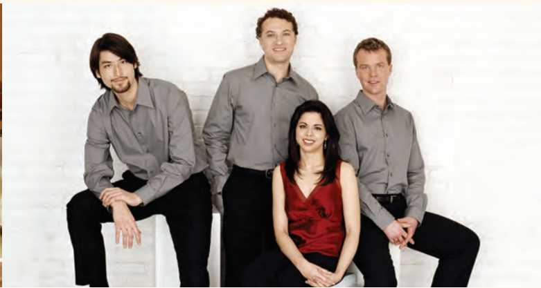
Pacifica Quartet