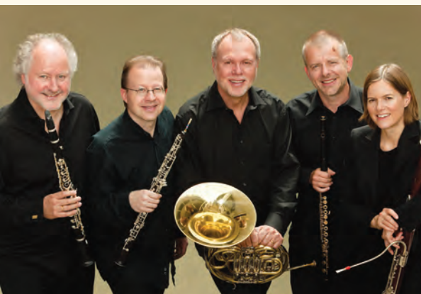
Berlin Philharmonic Wind Quintet